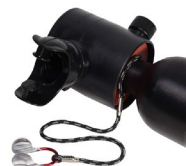
P/N 959 – Nose Clip with Lanyard