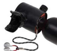
P/N 959 – Nose Clip with Lanyard